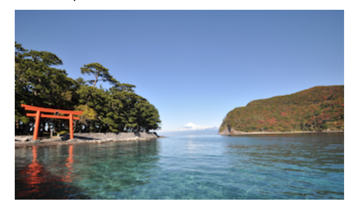
"Moroguchi Shrine, Heda"

We are deeply impressed that Schooner Ami, based in Numazu City that includes Heda in its domain, takes part in the "SCF Far East Tall Ships Regatta 2018" in the year of "Japan Year in Russia". We believe that Ami's participation will promote cultural and people-to-people exchanges between Japan and Russia.