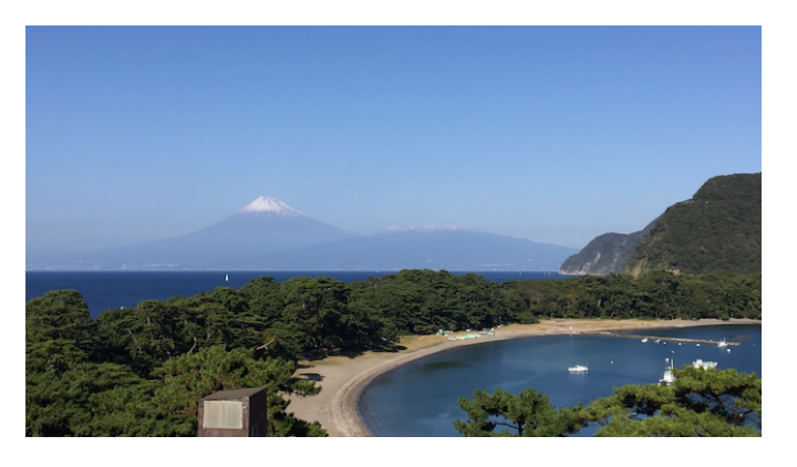
"Mt. Fuji seen from Mihama Cape, Heda"

Manhole covers are often printed with designs featuring symbols specific to an area or town in Japan.