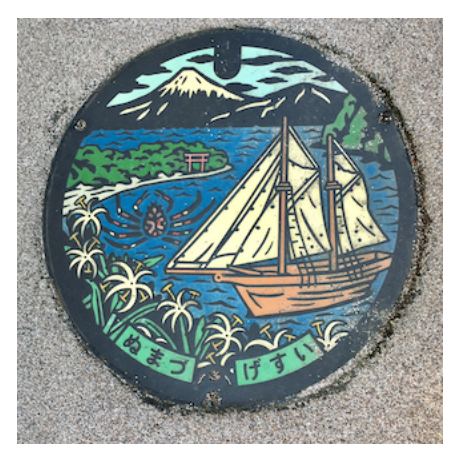
"Schooner Heda on a manhole cover, Numazu City"

After Treaty of Shimoda (the first treaty between Japan and Russia) was concluded, Putyatin asked the Tokugawa Shogunate (the last feudal government, known for the Edo period) for permission to build a new ship, and the Shogunate allowed the Russians to stay in Heda and decided to help them return to their country by building a ship. Local shipbuilders and the Russian sailors collaborated and built an 80-foot, 80-ton two-masted schooner in two months.